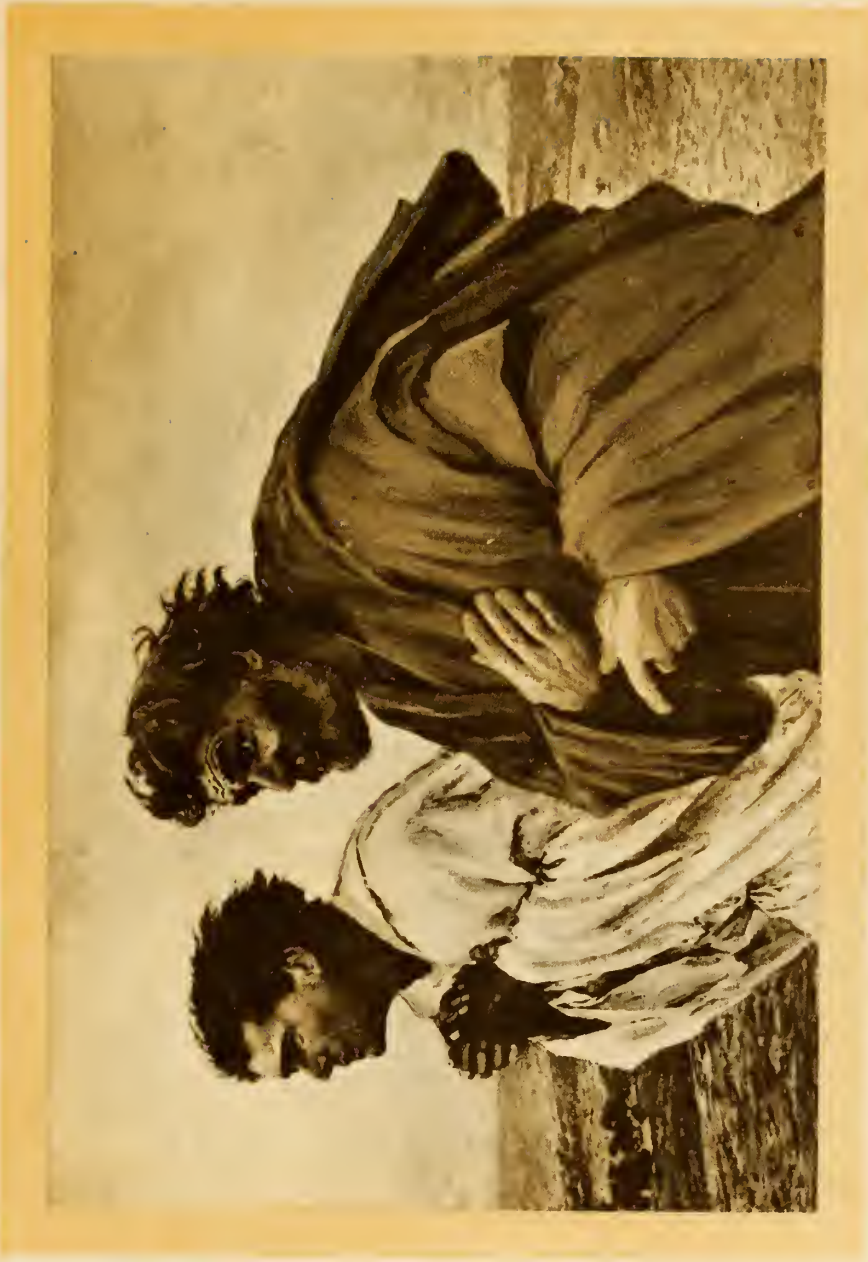
“Peter and that other disciple both ran together to the sepulchre.”